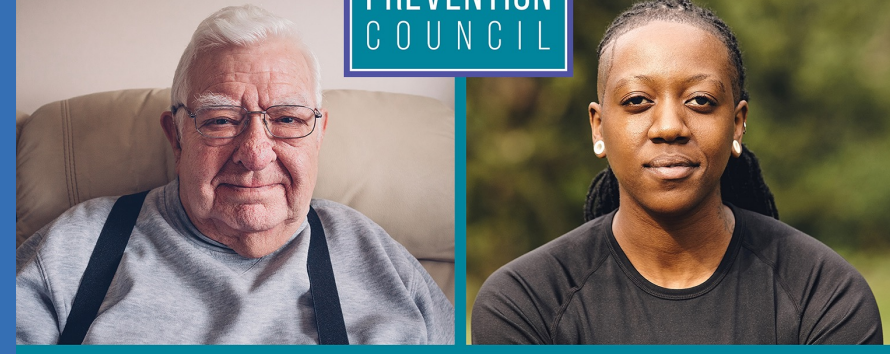
If you are in crisis, Call or Text 988 for the Suicide & Crisis Lifeline

Kung ikaw ay nakararanas ng krisis o nagtatangkang magpakamatay, tumawag o mag-text sa 988 upang humingi ng tulong