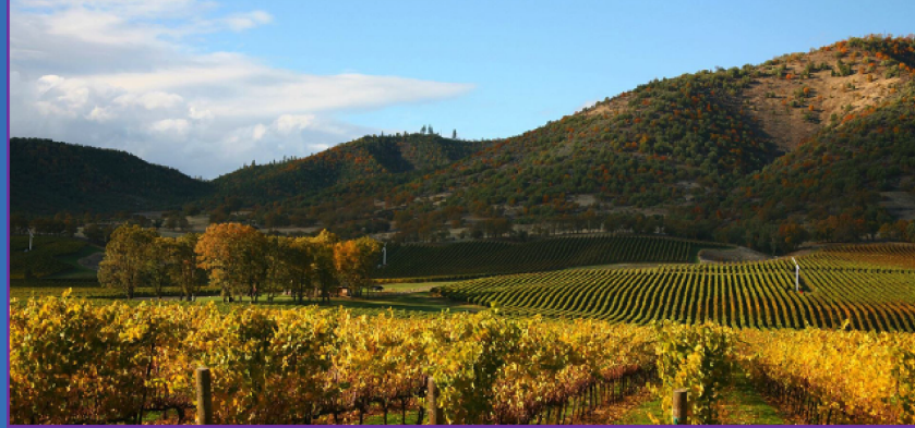
Presented by Napa County Suicide Prevention Council

Napa County - Strategic Plan for Suicide Prevention 2023 - 2026