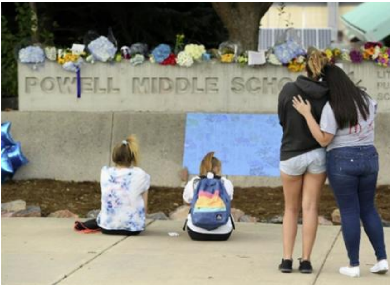
Self-harm rises sharply among tween and young teen girls, study shows

The latest news in mental health, plus information from the MHSOAC including upcoming events and job openings.